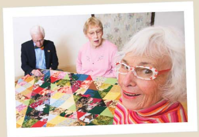
Quilting classes are a great way to meet people