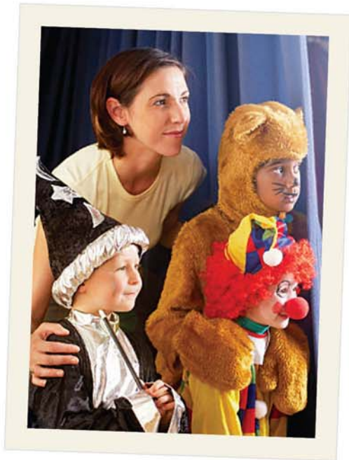
Children's Theater delights the crowd

Get in tune with one of several musical groups, or take center stage in adult and children's theater groups. We not only host visiting theatrical groups, such as Express Children's Theatre and Thunderbird Theater, but we offer field trips for individuals 50 years and better in and around Houston to arts venues like the symphony, theater, and local museums.