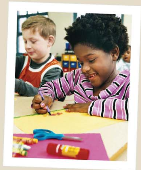
We raise funds to help some great kids