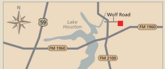
May Community Center 2100 Wolf Road, Huffman, Texas 77336 (281) 324-3373