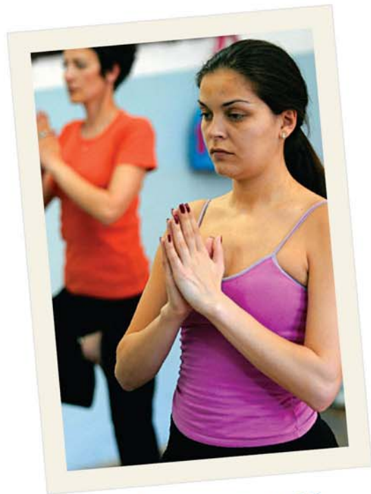
Learn new ways to relax

To get a handle on health and wellness issues, attend one of many seminars on various topics such as weight loss, stroke prevention, and CPR/first aid; join a health and wellness support group, receive vision screening, or register for annual flu immunizations.